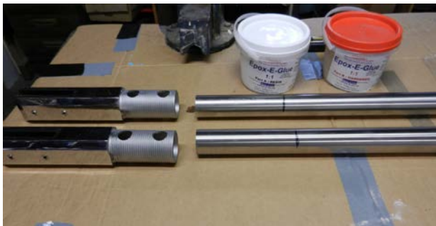
Stainless Steel Glass Brackets & Stainless Steel Post that were a sloppy good fit

Get around finding someone to weld Stainless Steel with the chance of damaging the highly polished surface by Gluing up with EPOX-E-Glue