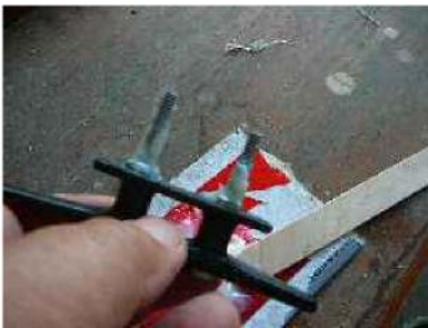
Apply glue to the screw threads