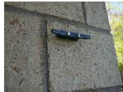
Push the screws into the holes and leave to set.

Get around finding someone to weld Stainless Steel with the chance of damaging the highly polished surface by Gluing up with EPOX-E-Glue