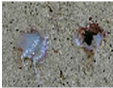
Put glue in the drilled holes