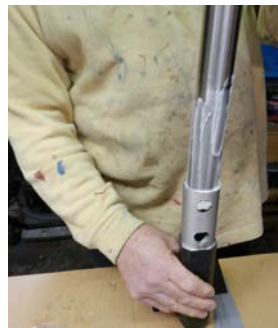
EPOX-E-Glue applied & Slid into Posts