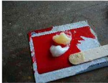
Equal parts by volume, by eye.