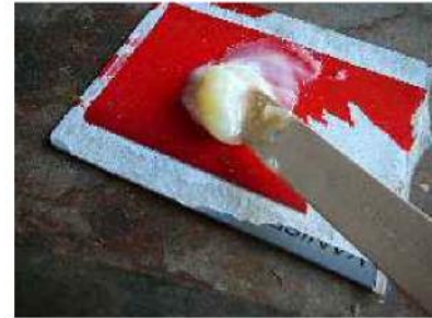
Mix the two parts.