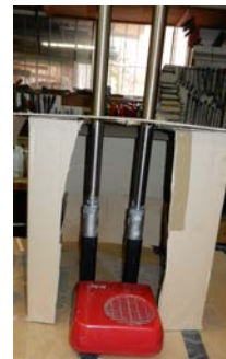
Accelerating EPOX-E-Glue Cure time by warming the metal

Proudly Distributed by: DRIVE Marine Services